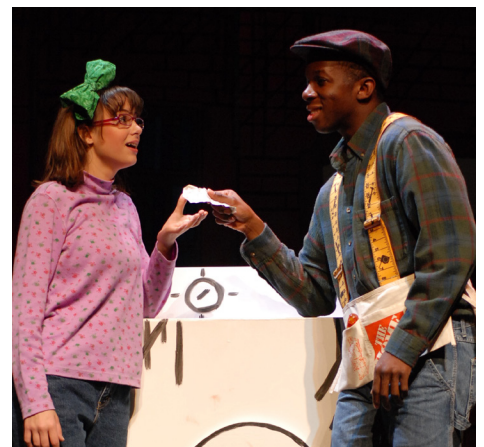
Junie B. in Jingle Bells, Batman Smells! 2010